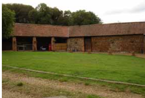
View from north-east - barn on right

A single-storey stone barn with a pantile and corrugated asbestos roof, partly lined with plastic. Open on the west side.