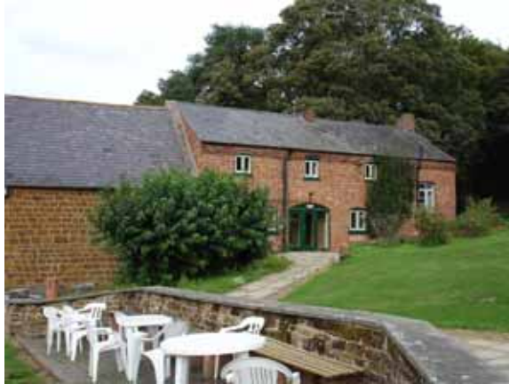
From south – right end of row

There is no human access into the roof void, so that area could not be checked for bats.