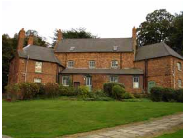
From west – facing farmyard

A high-roomed two-storey house with attic rooms, built of brick and some stone with a slate roof (not lined). There are slightly lower wings attached at the north and south ends at 45°. All now used as offices.