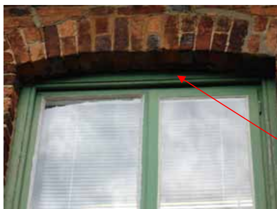
upper floor window – gap above frame

Externally, a pipistrelle roost was discovered over the top of the upper floor end window (at extreme right on above photograph). The bats squeeze between the top of the frame and the brick lintel. This roost was active in early summer 2006.