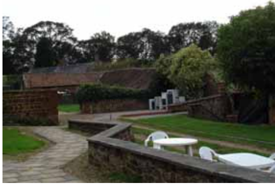
From north – stable on left

No signs of use by bats and no suitable day-roosting places inside or out.