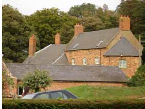
Farm-house and Low Barn from south

The buildings, a former model farm designed over 200 years ago, are arranged almost in a square with two arms of stables branching off (see Plan in Appendix). They are built mainly of local sandstone with some brick, under slate and pantile roofs. They were converted into a centre for local charities and rooms for functions.